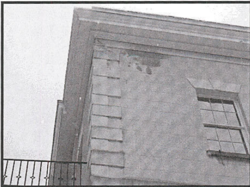
Figure 2 – Image illustrates water infiltration experienced at the southeast corner of structure's second story. Saturation of stucco surface is consistent with damage discovered with the building's second-story southeast collections storage room.