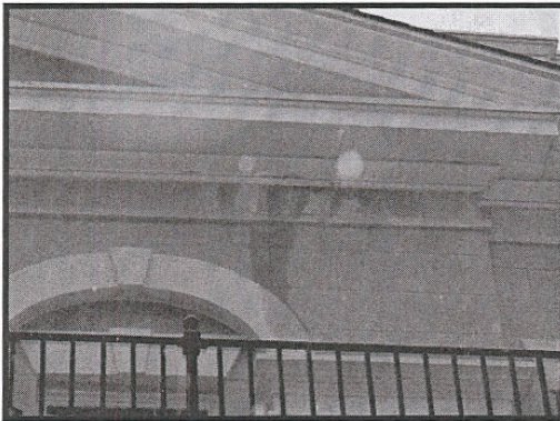
Figure 1 – Image illustrates active leak within copper roof/gutter system that has allowed rainwater to saturate the solid masonry wall of the structure's south façade to the point that stucco is weeping.