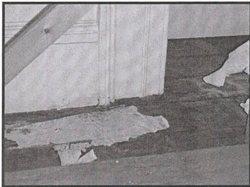
Figure 4 – Southwest second-story collections storage room has experienced damage to both its ceiling and floor along the west well. This image illustrates damage caused when water penetrated the room’s floor after having saturated over fifteen feet of masonry wall. Damage incurred included damage to (1) historic coverlet, which had been stored on rack in foreground and discoloration of wood trim and floorboards. Left untreated, original historic wood trim will continue to decay and mold growth will accelerate.